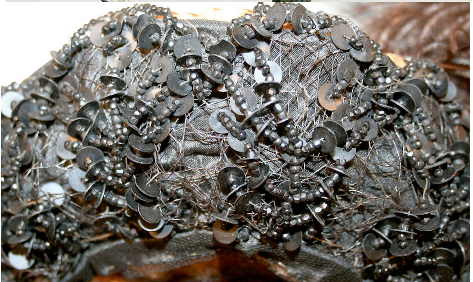
Note: the mesh of wires with jet beads and sequins over black fabric.