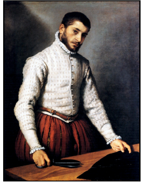
The unidentified tailor in Giovanni Battista Moroni's famous portrait of ca 1570